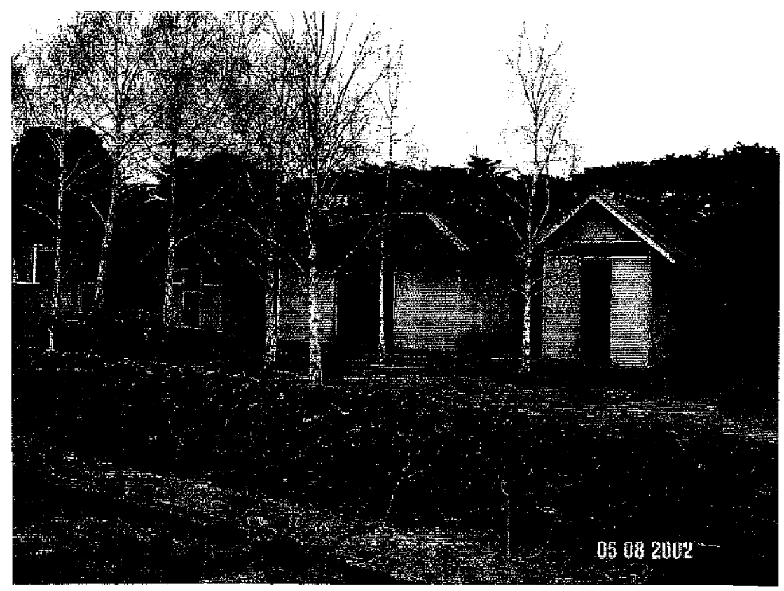
Outbuildings, Wintoc, Glenelg Highway, Glenthompson