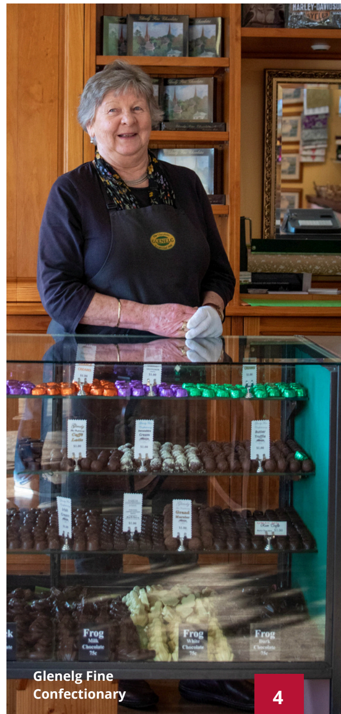
Glenelg Fine Confectionary

You are responsible for the behaviour of all people visiting your site. Additional guests must be added to your booking if remaining overnight. All park rules apply to guests.