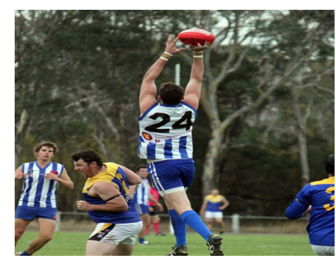
Balmoral & District Community Plan