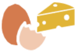
Eggs & Dairy

Your FOGO bin is for your Food Organic and Garden Organic (FOGO) waste. ALL food waste is accepted.