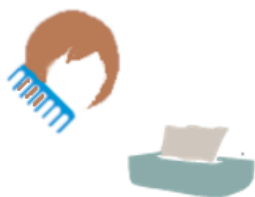
Hair & Tissues