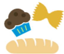
Bread & Pasta