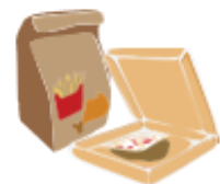
Food soiled paper packaging