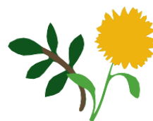
Prunings & Weeds