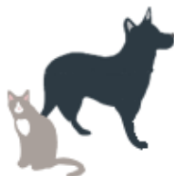
Pet poo & hair