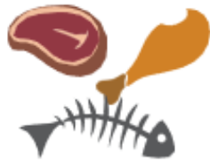
Meat & Bones