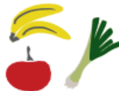
Fruit & Vegetables