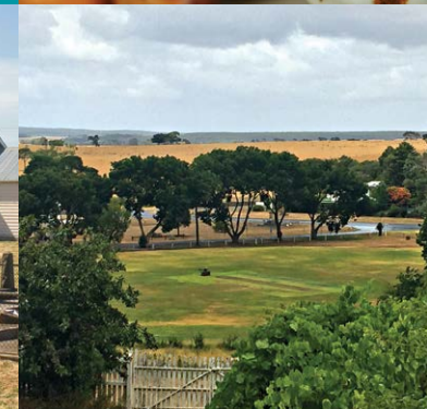
The Byaduk Caves are the most extensive lava caves in Australia