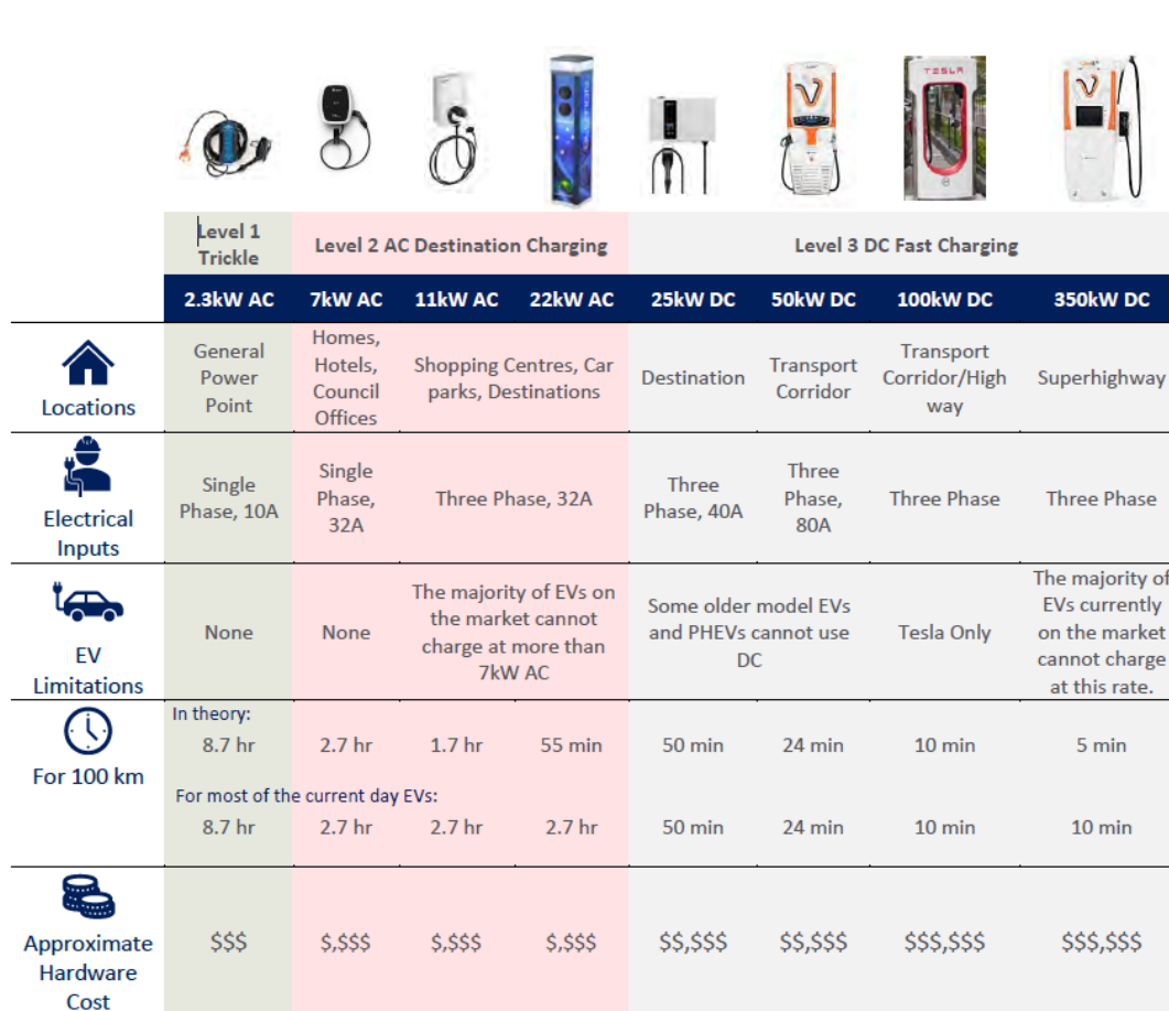
Fig. 2. Charging infrastructure options

The most appropriate role for local government in the transition to EVs is a matter that is not agreed upon.