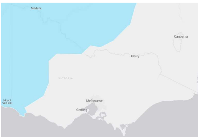
Figure 2: Western Grey kangaroo distribution in Victoria