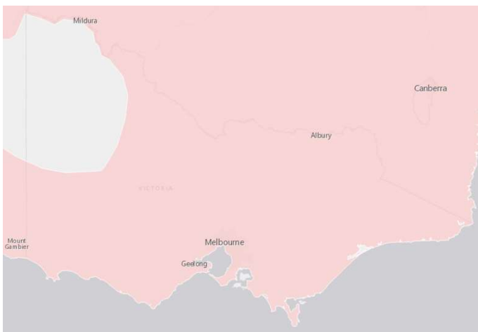
Figure 1: Eastern Grey kangaroo distribution in Victoria